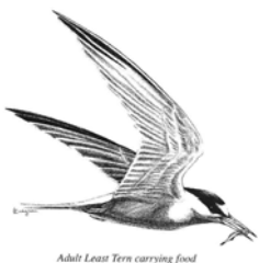
Adult Least Tern carrying food