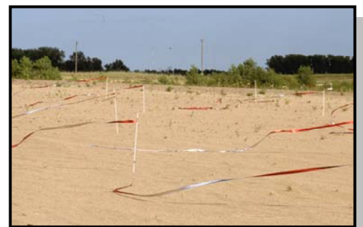
Deterrent mylar flagging

43 – Conflicts resolved since 1999. 60 – Volunteers per year. 130 – extra piping plovers produced because of implemented management techniques. 430 – extra interior least terns produced because of implemented management techniques. ZERO – Fines to participating industry partners since 1999.