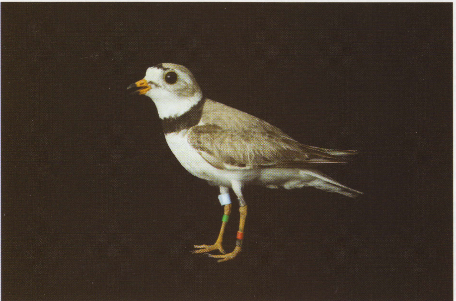
Figure 2. Piping Plover wearing colored leg bands.